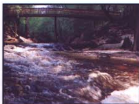
Big Shoals - Suwannee Rapids

This more than 4,000-acre area is bordered by the town of White Springs. Big Shoals is best known for its namesake, a one-mile stretch of rapids on the Suwannee River formed by water coursing over a limestone bed with rocky outcroppings. Riding in this area offers intermediate to expert bicyclists varied terrain with scenic vistas from high river bluffs. Big Shoals offers a mixture of sandhill and hammock roads and single-track trails. The paved Woodpecker Trail connects the two parking areas, and cyclists often visit Little Shoals, a smaller set of rapids, while in the area.