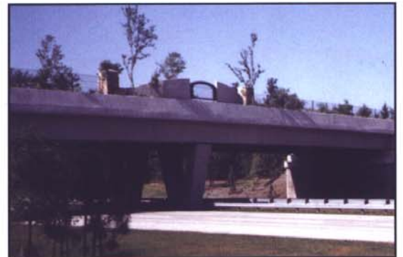
Marjorie Harris Carr Cross Florida Greenway Land Bridge over I-75 (see Trail 14)