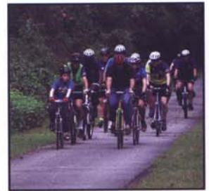
Tallahassee-St. Marks Historic Railroad State Trail

The paved trail runs from Florida's capital city, past the Apalachicola National Forest, to the coastal community of St. Marks. Cyclists will find fresh Florida seafood, fishing, and San Marcos de Apalache Historic State Park. Through the early 1900s, this historic railroad corridor was used to carry cotton from the plantation belt to the coast for shipment to textile mills in Europe. Today, a canopy of foliage overhangs the trail. Deer and foxes are occasional visitors.