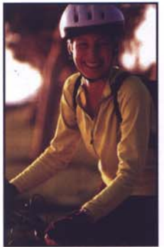
Enjoying one of the many bicycle trails throughout Florida

Florida Greenways & Trails (352) 302-0051; 7:00-4:00, 7 days a week www.floridagreenwaysandtrails.com