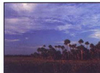
Everglades National Park

(305) 221-8776; 8:30-4:45, 7 days a week www.nps.gov