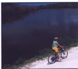
Gasparilla Island - Boca Grande Trail

(239) 394-3397; 8:00-Sunset, 7 days a week www.floridastateparks.org