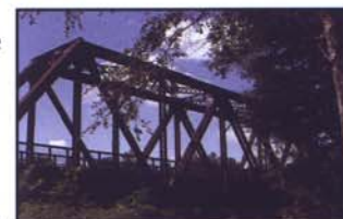
Nature Coast State Trail Railroad Bridge

This paved trail provides an excellent opportunity to experience the Sunshine State's "off the beaten path." The trail consists of two primary alignments built along former rail lines that meet at Wilcox Junction, connecting the communities of Cross City, Trenton, Fanning Springs and Chiefland. A historic train trestle carries the trail across the Suwannee River near Old Town. Trail users can cool off in the 72-degree springs in nearby Fanning Springs State Park, or watch for more wildlife at Andrews Wildlife Management Area.