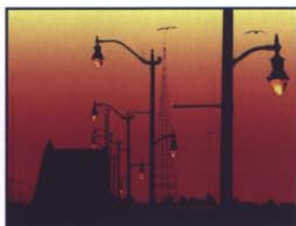
Friendship TrailBridge at Sunset

The pavement of this trail is the deck of the "old" Gandy Bridge, saved from demolition at the urging of local citizens of Hillsborough and Pinellas counties when a new bridge across Tampa Bay was built for the Gandy Highway in the late 1990s. Connecting the Tampa and St. Petersburg areas, the TrailBridge is now used by bicyclists, walkers, skaters and even fishermen, and is a good way to catch bay breezes all year long. Users may see dolphins jumping in the bay and brown-headed pelicans flying above.