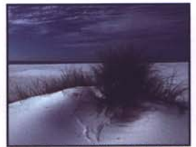
Topsail Preserve State Park found near Timpoochee

This trail is a popular path through the Beaches of South Walton. Named after Timpoochee Kinnard, the most influential Indian Chief of the Euchee Indians, this paved path parallels Scenic Highway 30-A, surveying the sugar-sand beaches and emerald green waters of the Gulf. The path winds through 7 of 13 distinct beach communities, with unique coastal names such as Dune Allen, Blue Mountain, Grayton Beach, Santa Rosa Beach, Watercolor, Seaside and Water Sound. From migrating flocks of birds to blooming wildflowers and trees, this breezy coastal ride showcases nature's beauty all year long.